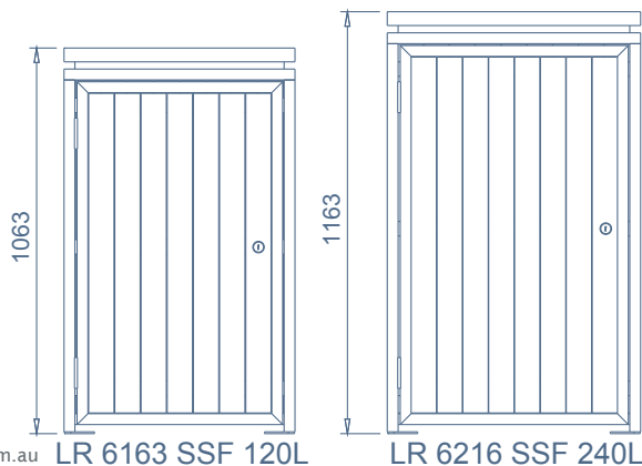
LR 6163 SSF 120L